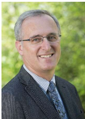
CS Caritas Socialis GmbH

All facilities of CS Caritas Socialis GmbH are part of CS Caritas Socialis Privatstiftung. Some facilities are funded by the Fonds Soziales Wien (FSW). The CS Caritas Socialis Privatstiftung exclusively pursues the non-profit purpose of securing the continued existence of the facilities of CS Caritas Socialis GmbH.